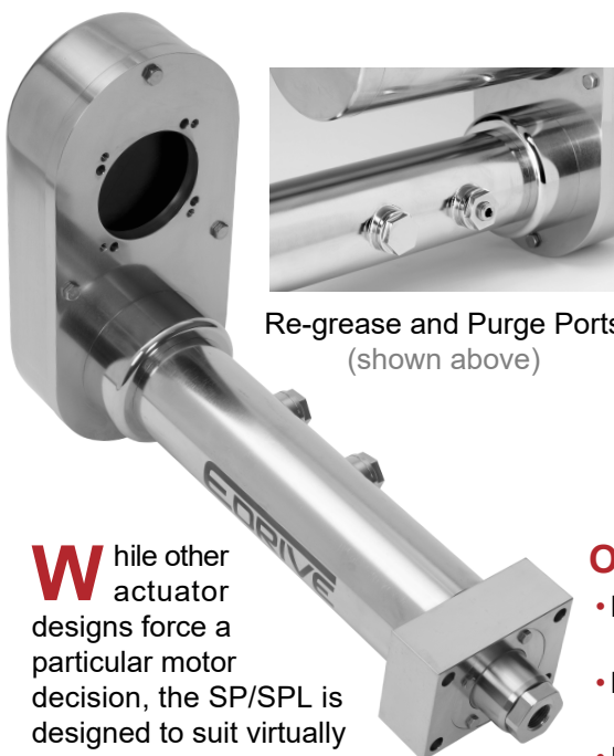
Re-grease and Purge Ports (shown above)

and 2:1 synchronous gear belt ratios. Machine tool design principles and guidelines ensure the robust sizing of all components. Traditional front flange, bottom, foot, and trunnion mounting capabilities are available as standard designs.